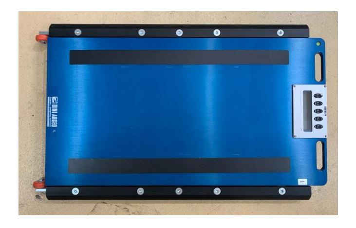
FIGURE LM 6/9C/322 - 1

(a) Dini Argeo Model WWS Weighing Instrument