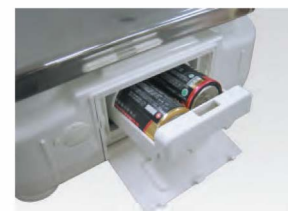
The battery box makes it quick and easy to replace batteries.